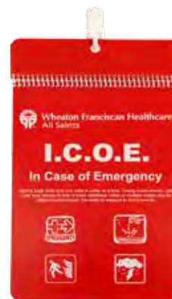
Large 9x12 Polyboard Guide

Our sales department will provide you with information regarding the various options and pricing. Our production staff will assist you in designing a Guide to Emergency Preparedness that meets your organization's unique needs and exceeds your expectations.